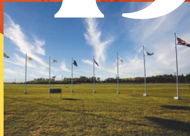
The Numbered Treaties, 1871 to 1921, were integral to the growth and development of Canada and are foundational agreements that continue to guide us today.

There are seven different Treaty territories in present-day Manitoba: Treaty No. 1, Treaty No. 2, Treaty No. 3, Treaty No. 4, Treaty No. 5/Treaty No. 5 Adhesion, Treaty No. 6, and Treaty No. 10. Dakota traditional territory is located in southwestern Manitoba. Treaty No. 9 forms the northeastern point of the province; however, there are no communities there. All Manitobans reside within a Treaty territory.